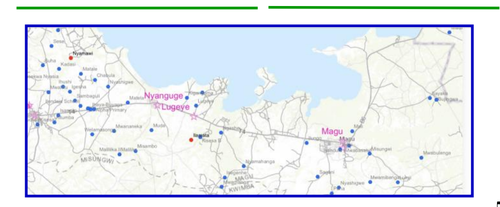
Map of CT's current wells and monitoring projects.