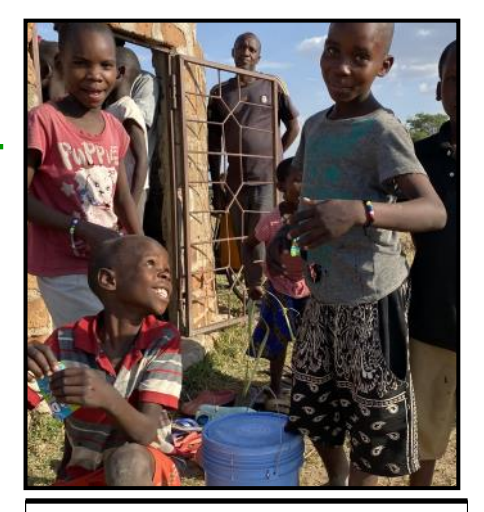
While monitoring the well at Welemasonga (drilled in 2010), the team distributed salvation bracelets and suckers. This pump is working nicely!

The average cost to repair a pump is $1500—$1,800. If you want more information or are considering sponsoring one of these repairs, please contact us.